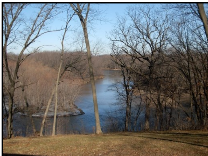
View of the Cedar River from the future site of the cabin at Cedar Bend Park

Picture this... a porch swing, a hot cup of coffee in your hand, a wonderful high top view of the Cedar River below, the sun making its way above the horizon. Sound nice? That is the type of experience the Bremer County Conservation Board is working at creating. Plans are beginning to come together for a cabin at Cedar Bend Park a few miles north of Waverly. The spot in mind would check off all those boxes of the opening sentence. The vision of the project is to construct a full-service cabin that will comfortably sleep 6 and feature 2 bedrooms, 1 bathroom, heat and air conditioning, and a full kitchen. The prime location and modern amenities will make this cabin an excellent choice for local families planning to stay a little closer to home, as well as a new lodging option for area visitors.